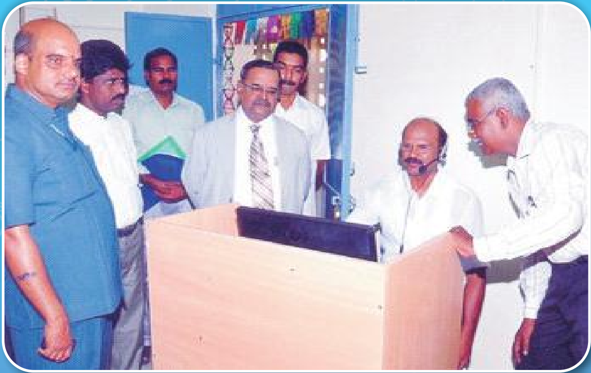
Honourable Minister sharing his jubilation in the Foreign Language Laboratory