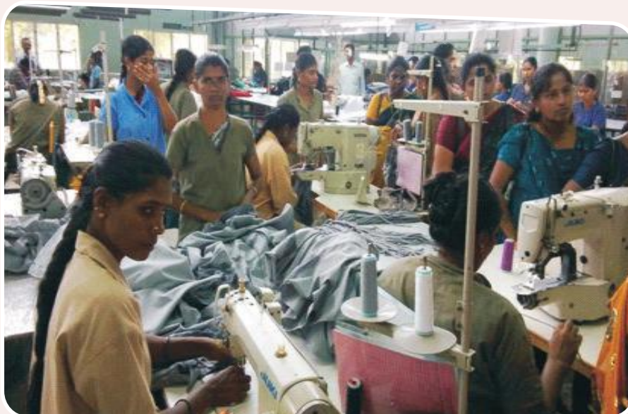
Industrial Visit of the Entrepreneurship Trainees at Coimbatore & Tiruppur