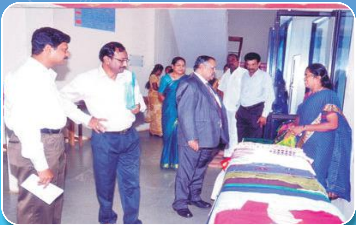
Trades of Aari work and Glass Painting - Display