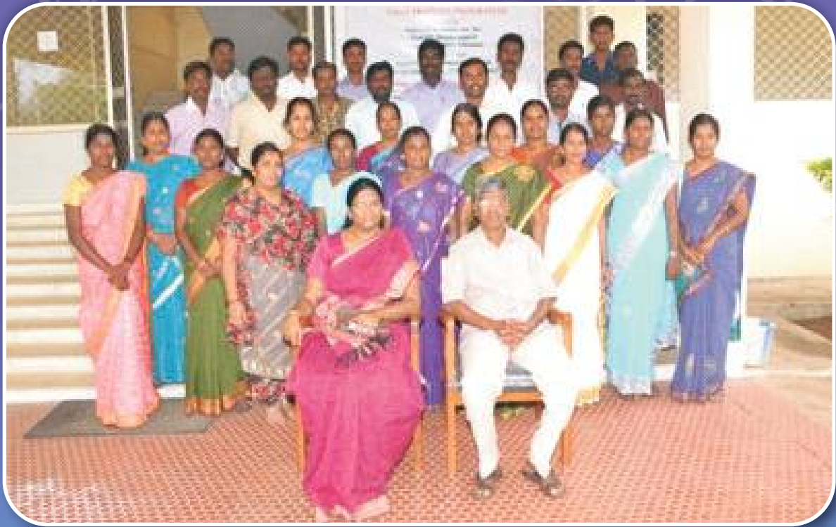
Orientation Programme to the Visually Impaired