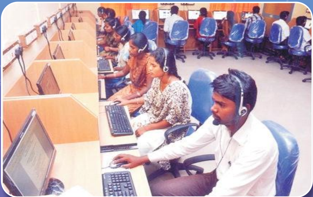
The students benefit by practising the skills in the Language Lab.