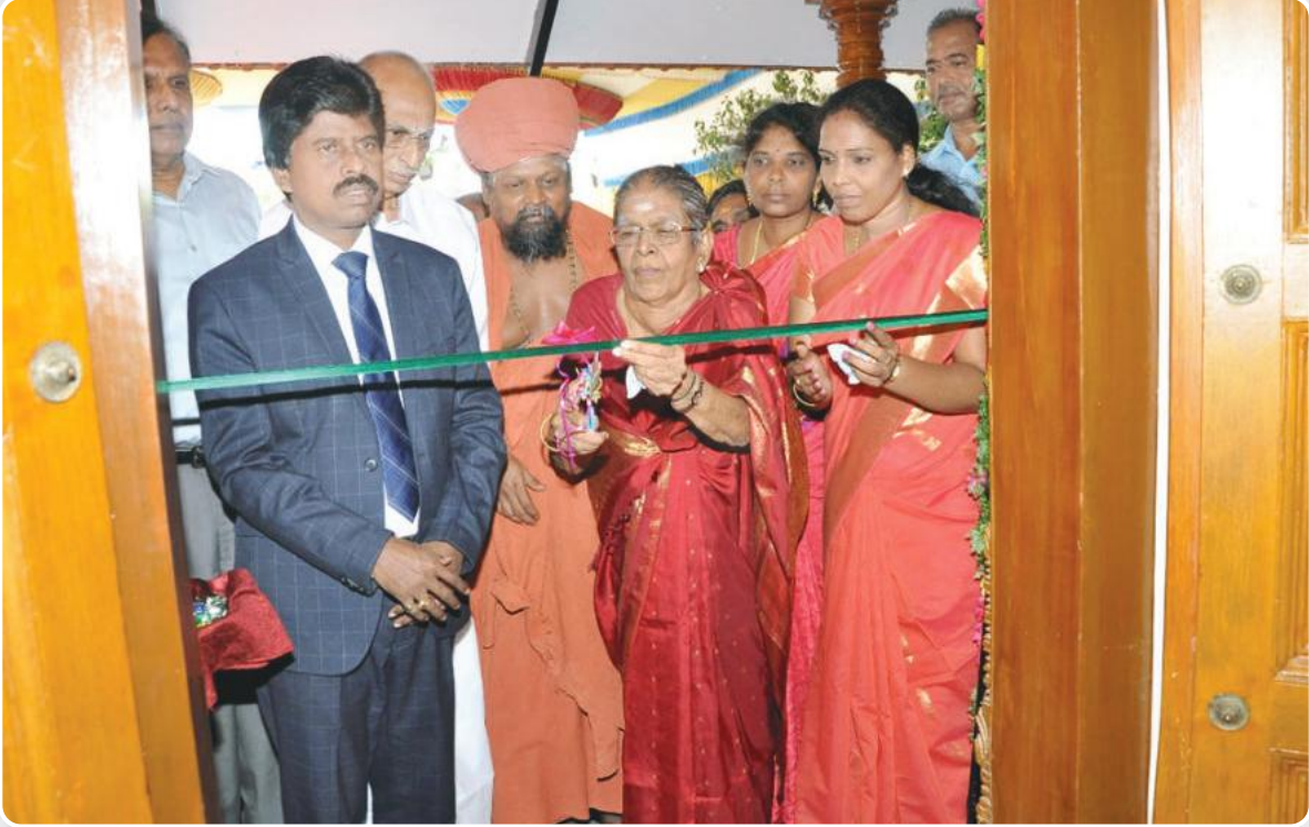
Dignitaries at the Inauguration of Vallal Dr. Alagappan Museum