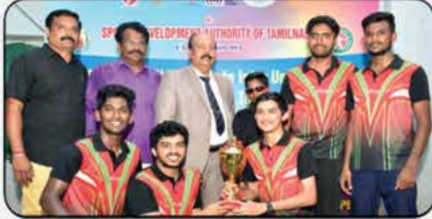
Table Tennis Competitions Conducted

With financial assistance of the Sports Development Authority of Tamil Nadu, Chennai, Alagappa University's Directorate of Physical Education conducted Table Tennis competitions for men and women on 30.05.2019 and 31.05.2019 at Alagappa University Physical Education College. Eight teams from Tamil Nadu Universities participated in the two-day competitions.