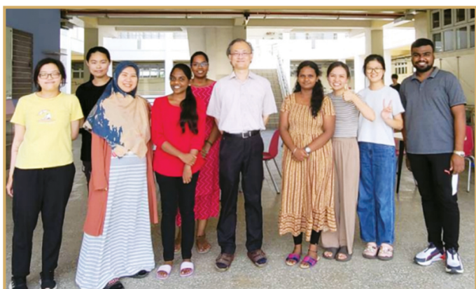
Alumni Meet and Parent-Teacher Meet